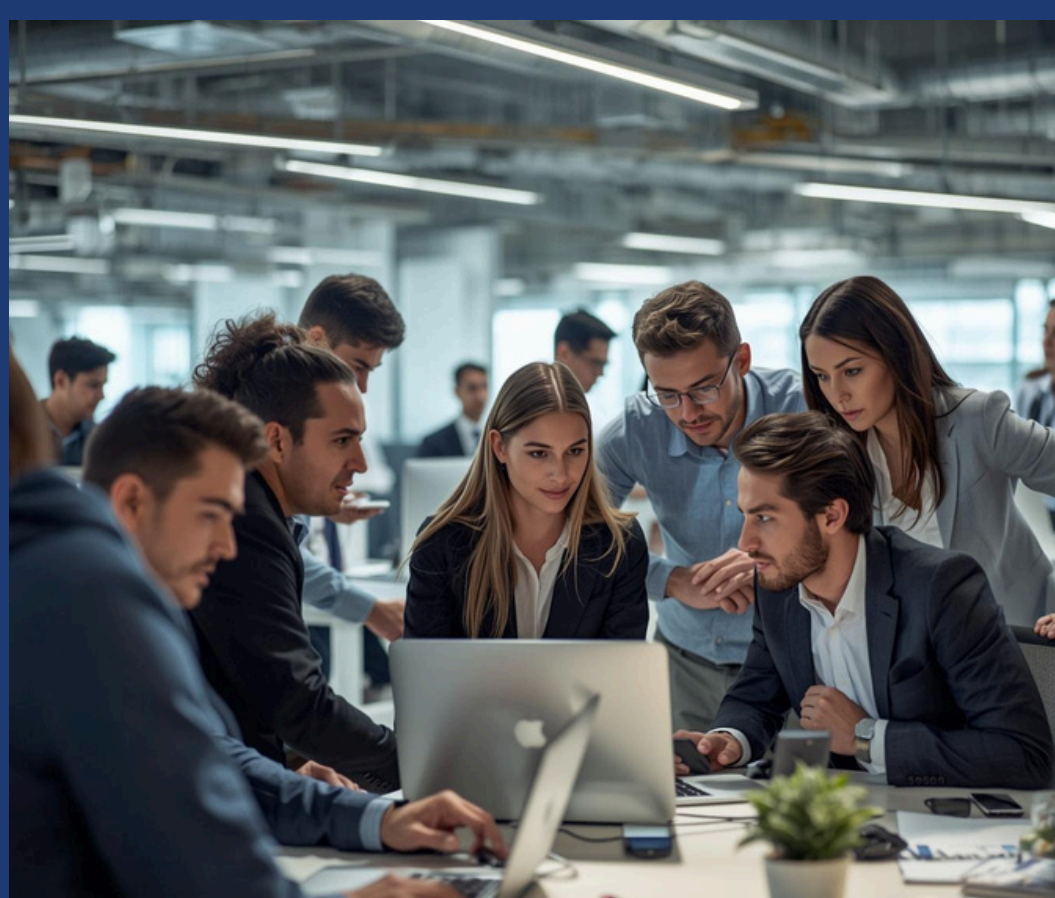
Planners / Schedulers