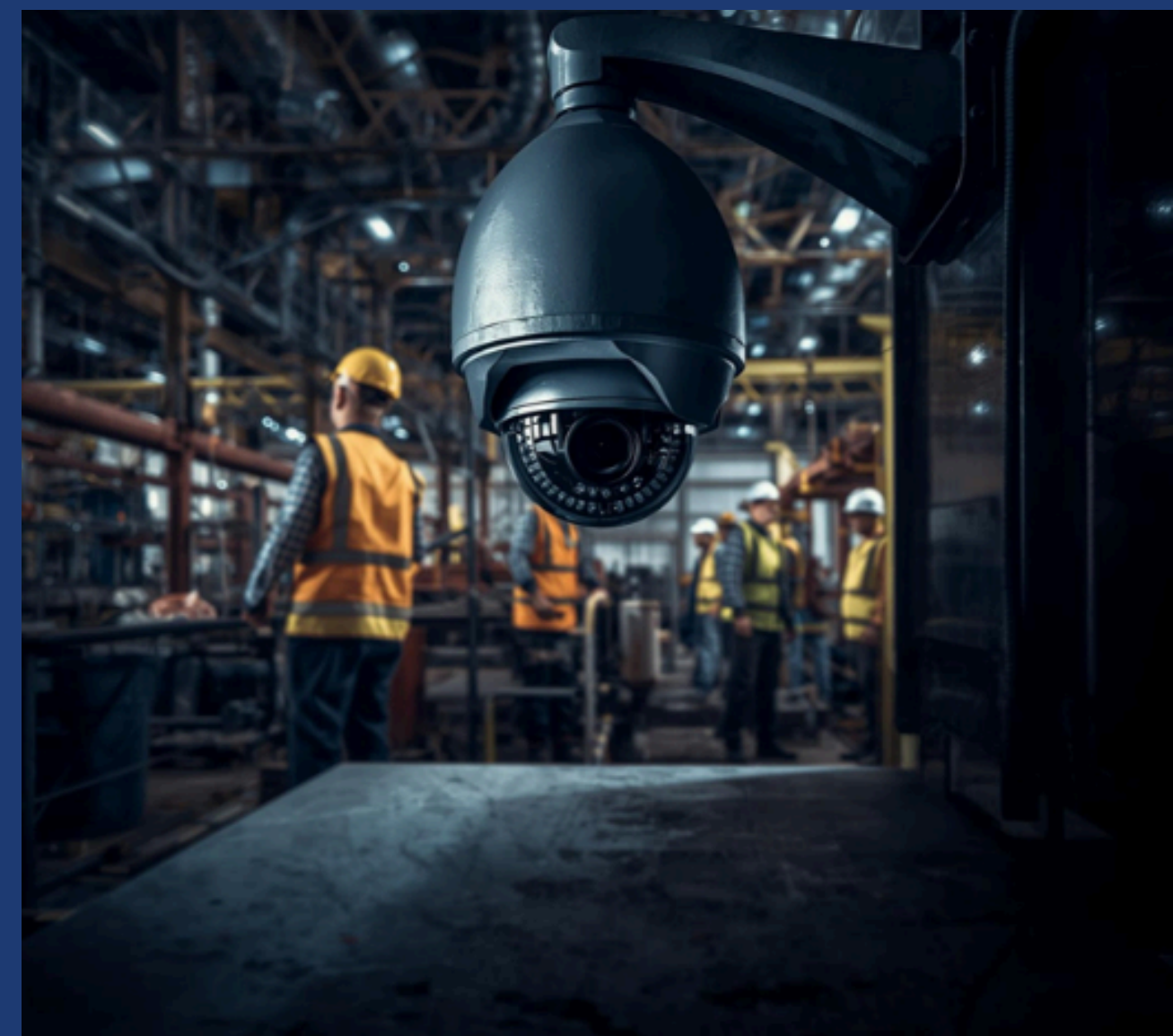
VIDEO ANALYTICS AND AI SAFETY SOLUTIONS