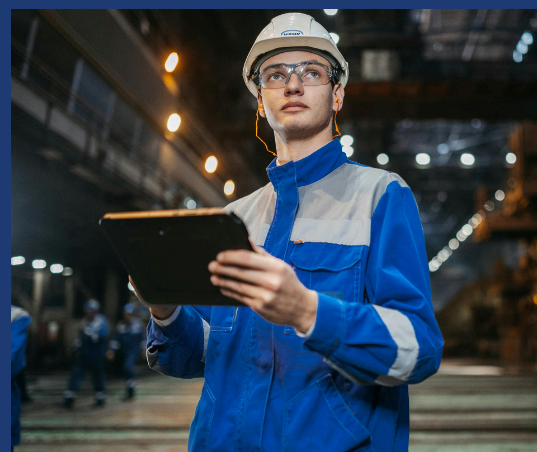
HSE Officers / Supervisors