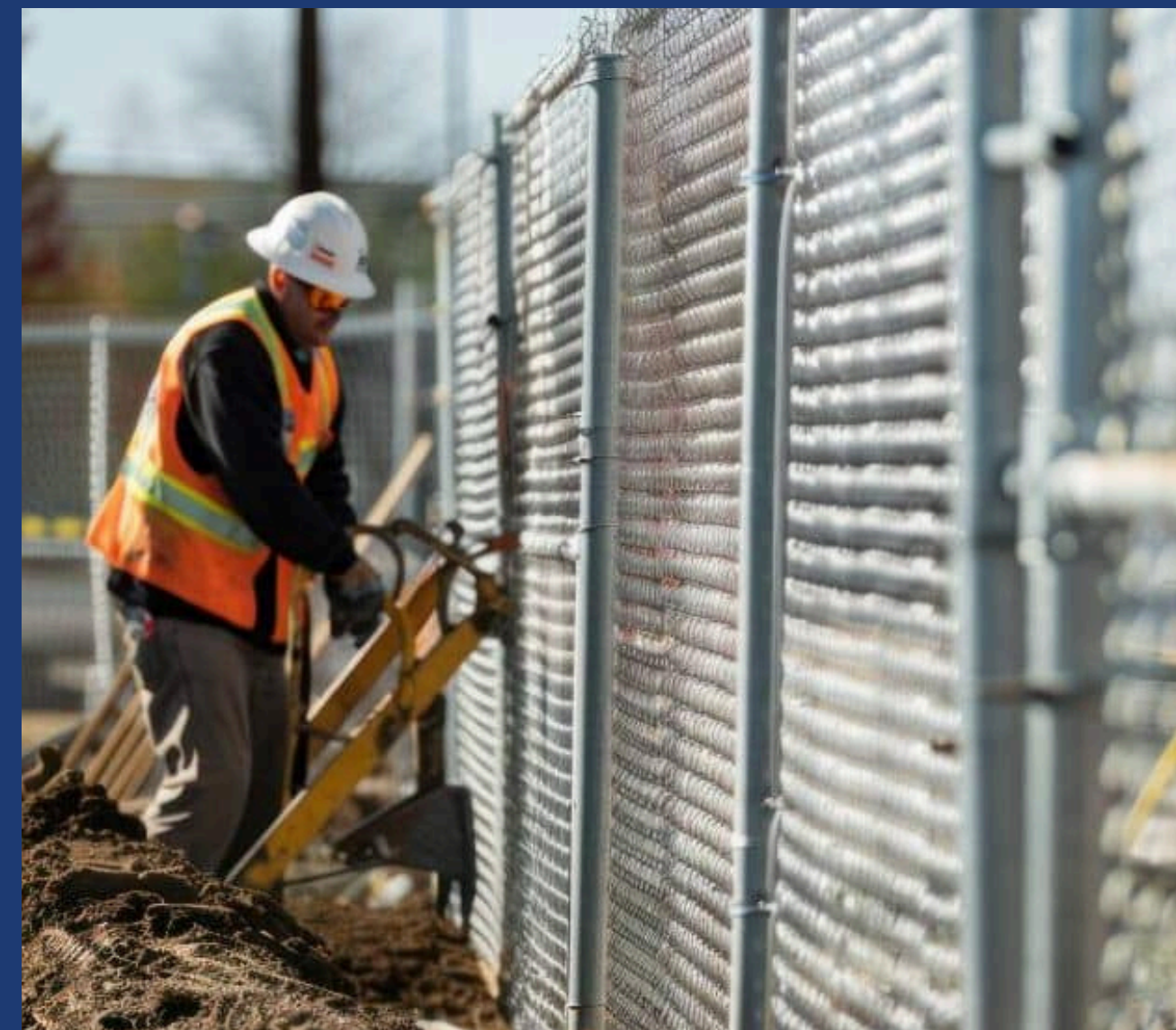
ALL TYPES OF SECURITY DENCING