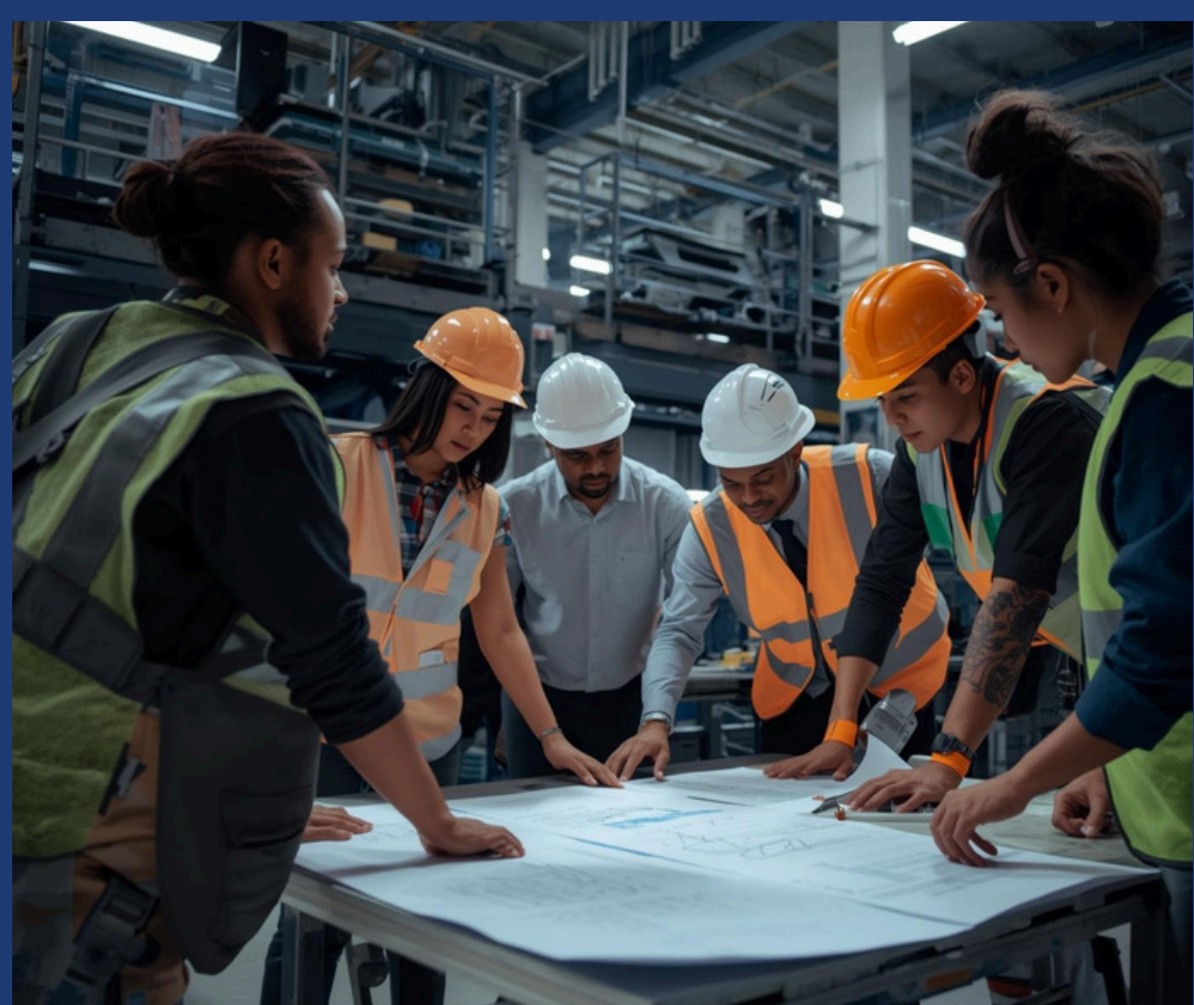
Project Engineers / Managers