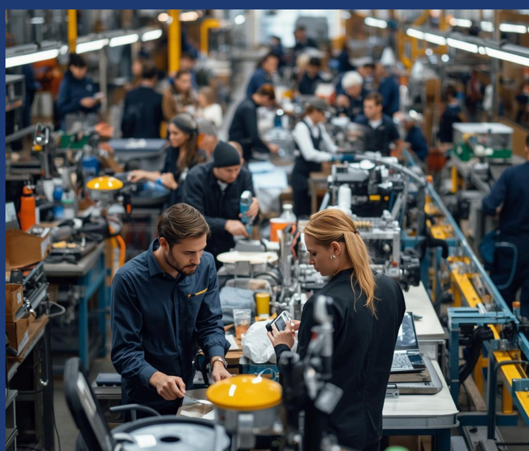
Mechanical, Electrical, Civil, Instrumentation